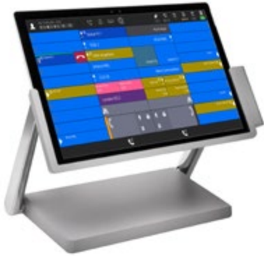
Kensington SD7000 Surface Pro Docking Station