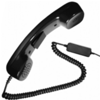
IMTRADEX Hand Receiver HS3 with Push-To-Talk (PTT)