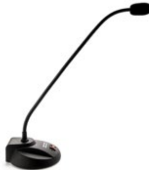
Buddy Desktop Mic 7G USB Adjustable Gooseneck Microphone