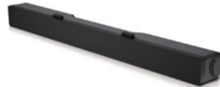
Dell AC511 Stereo USB Sound Bar with Headphone Jack