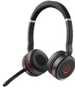
Jabra EVOLVE 75 Bluetooth/USB Noise Cancelling Headset