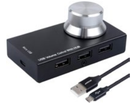
USB Volume Controller With 3 USB Hub Port