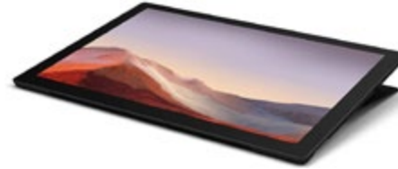
Microsoft Surface Pro 7 – 256GB Solid State Drive